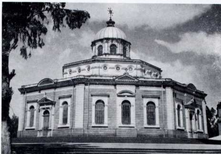
Ethiopian Consulate General and Modern Tours

The Ethiopian nation and church touch the life of the other peoples of the Christian East at numerous points, playing at times a surprising role in affairs outside, but their inner history has been so little recorded or studied that every contact has a romantic air of mystery. And in our day it is hard to realize that the legendary realm where descendants of King Solomon and the Queen of Sheba rule and Prester John was reputed to be both priest and king has been drawn into the rapidly moving orbit of the modern world and would rather be known for its foreign-trained leaders, up-to-date schools, and imaginative public works. In these few paragraphs one cannot do justice to the land