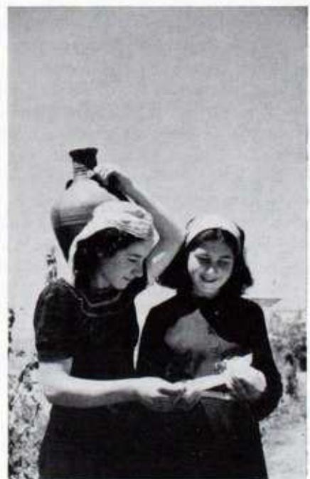
Ivan Dmitri for American Export Lines Two Lebanese girls discuss a letter