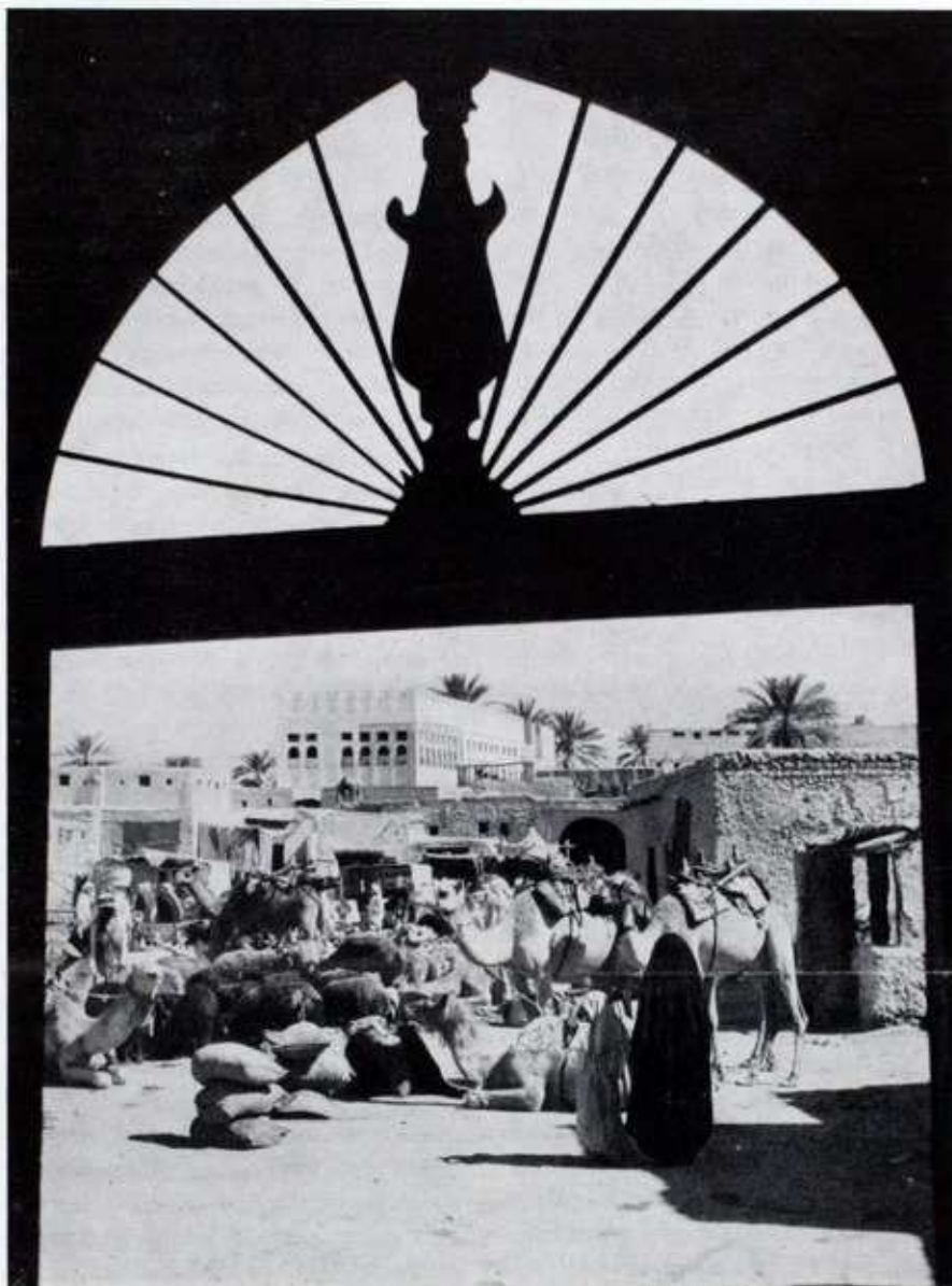
Standard Oil Company (N. J.) The market square at Qatif in Saudi Arabia