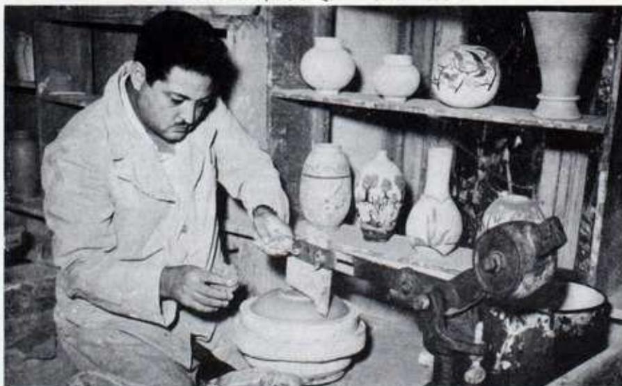
An Egyptian potter at his workshop in Cairo