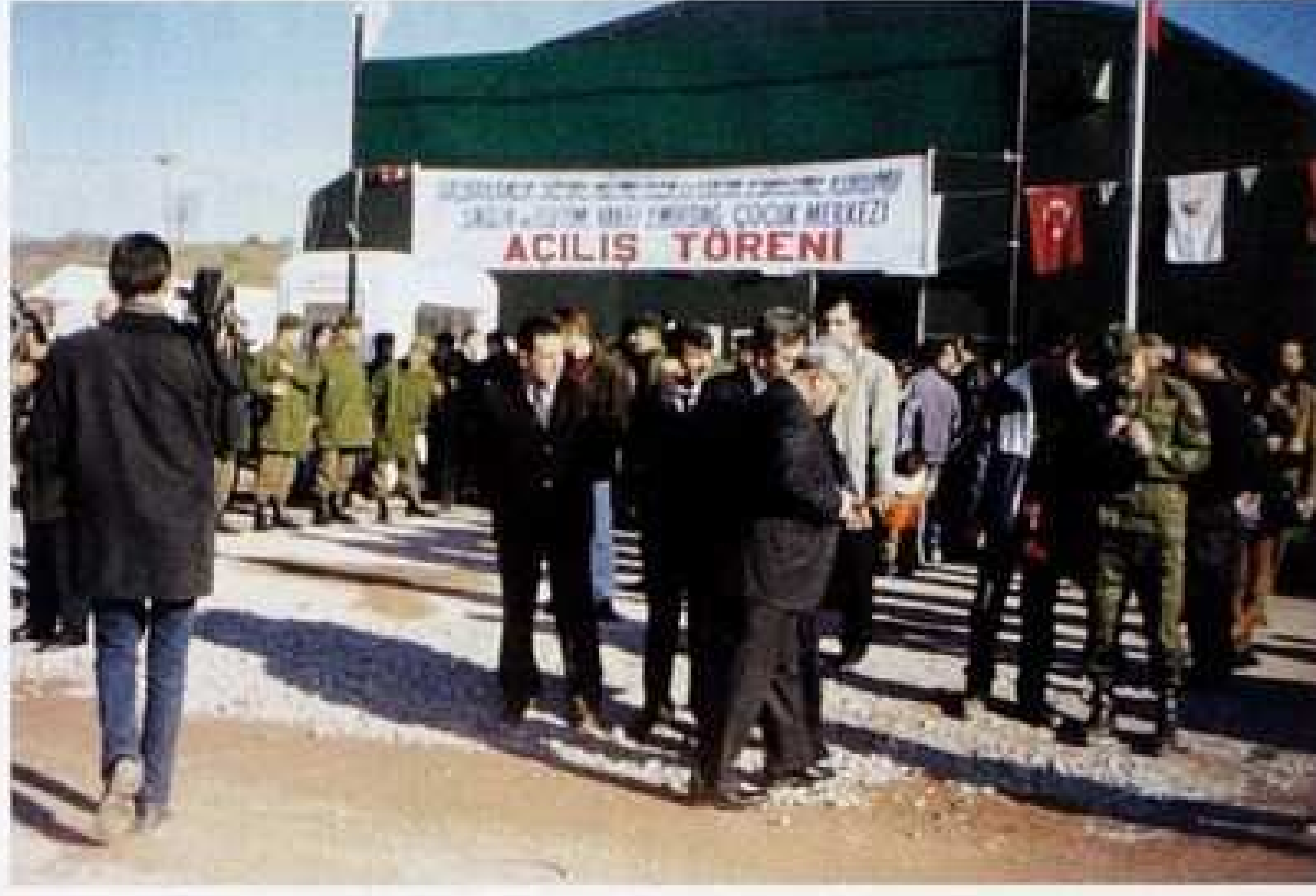
From the opening ceremony of the Emirdağ Children's Center