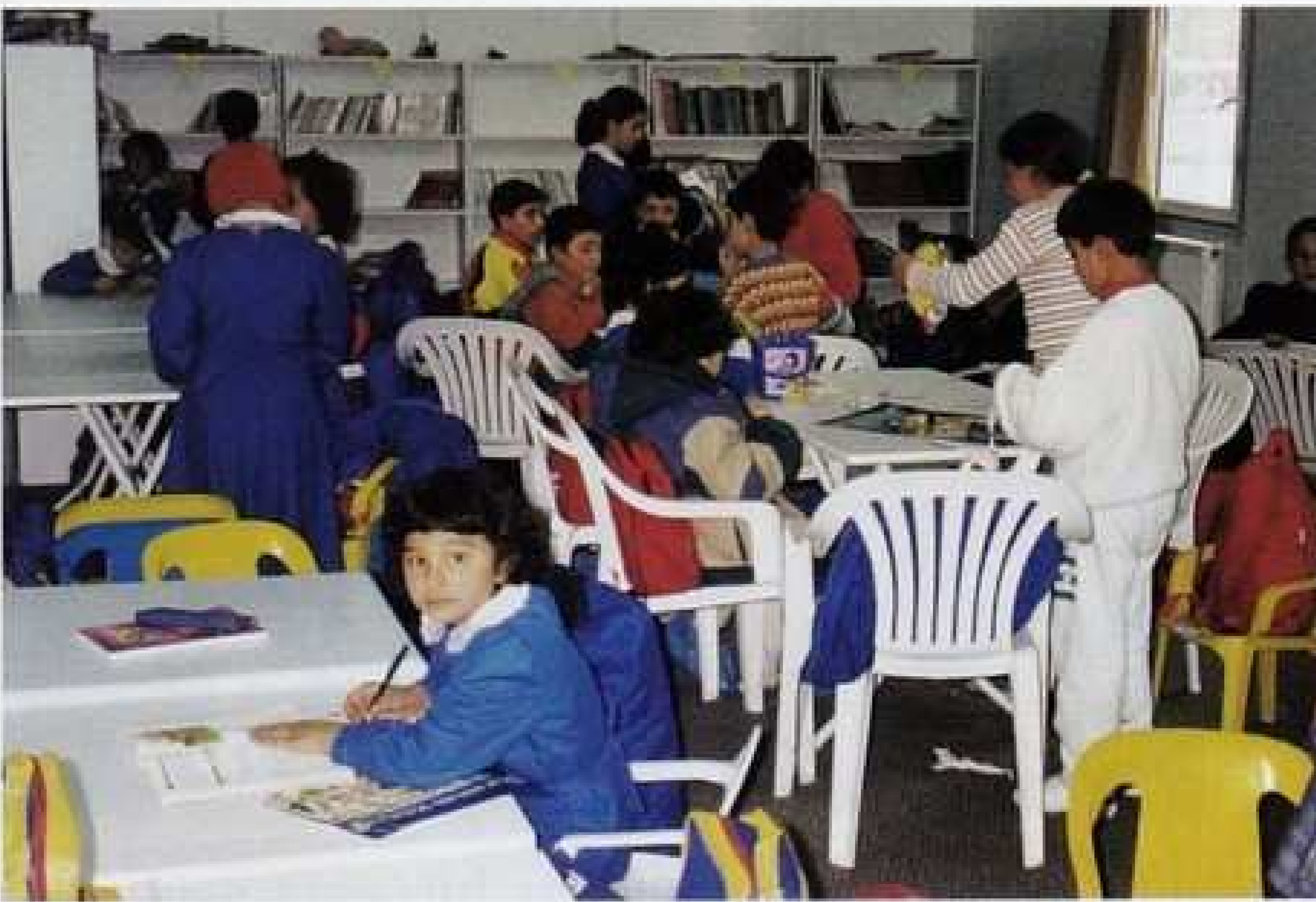
Children who benefit from the Center