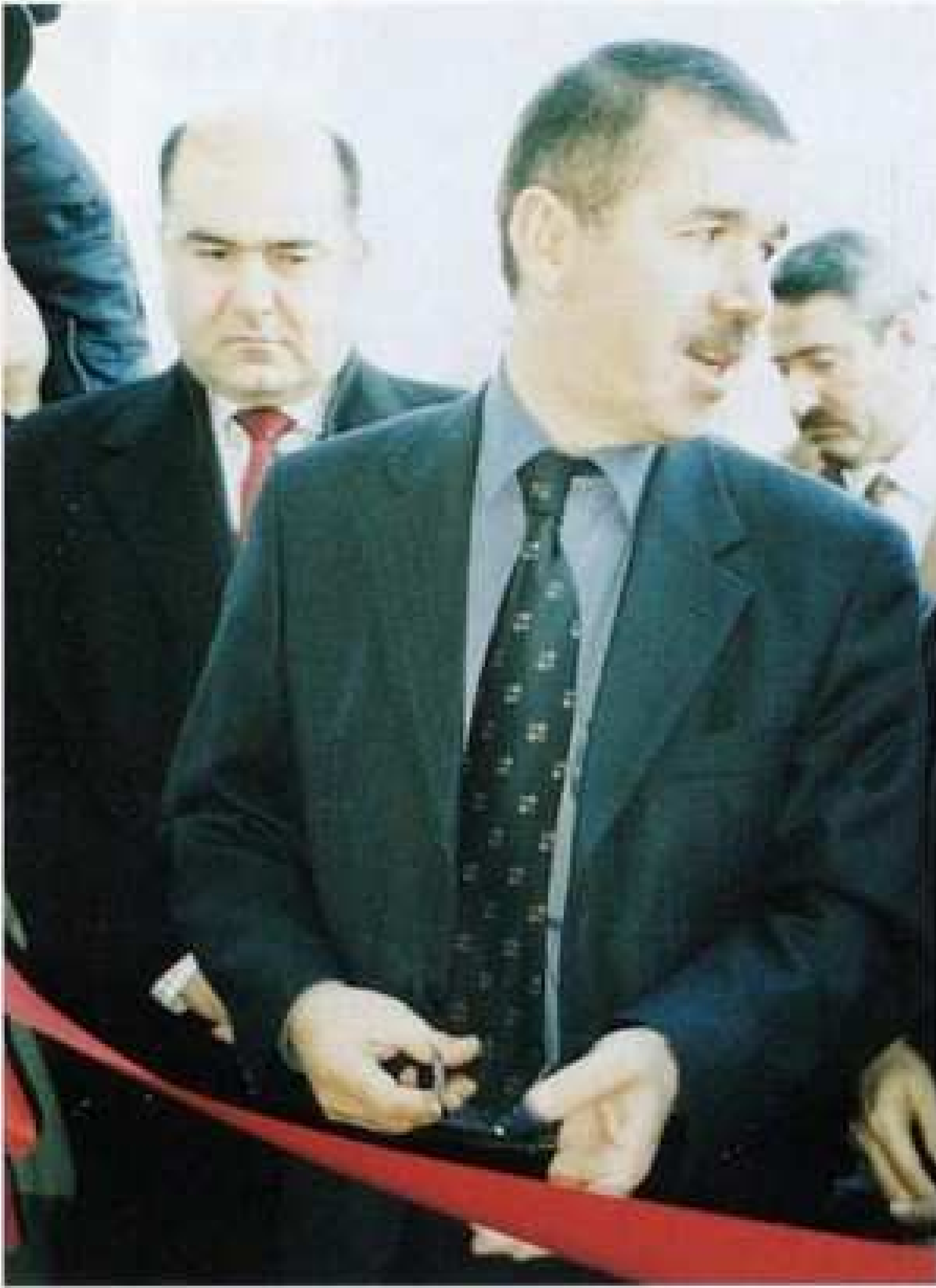
Minister Hasan Gemici was present for the opening ceremony