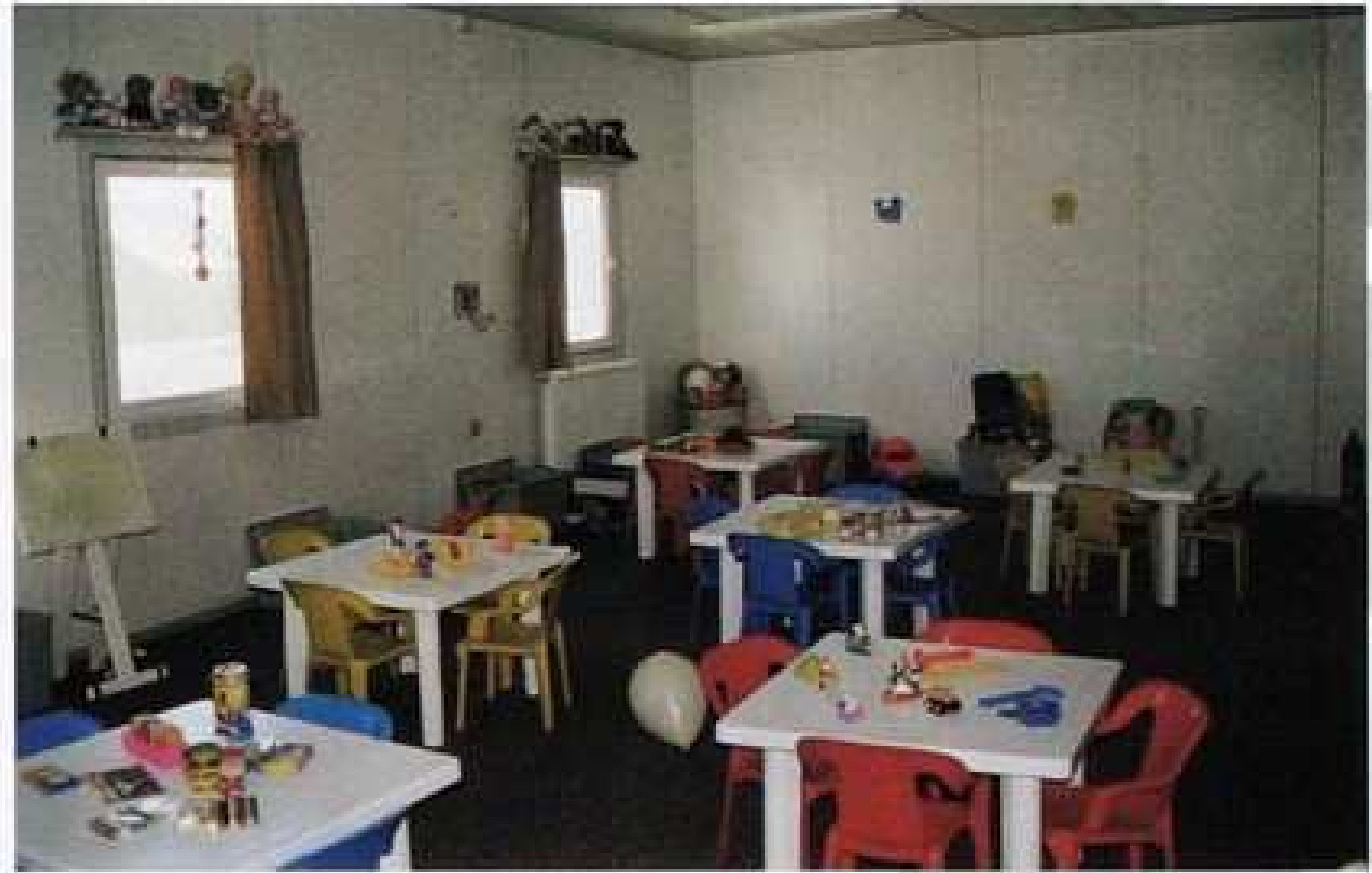
View of the Center from inside